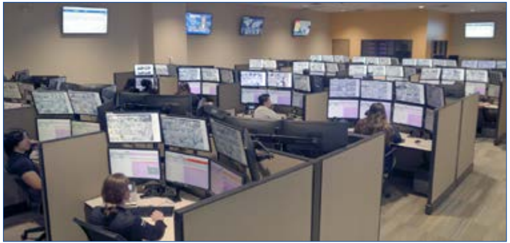
Interface's innovative Central Command Center offers Virtual Guard interactive monitoring solutions that protect businesses 24/7/365.

Panda turned to Interface Security Systems, a leading provider of managed network, asset protection, and business intelligence solutions for a customized solution. First, to address the false alarm challenge, Interface installed a next-generation IP Interactive Monitoring system with live video and two-way audio, which offers a virtual, guard-like level of protection in every Panda location. Operators in the Interface monitoring center instantly verify any alarm from a Panda store with live streaming video, eliminating false alarms.