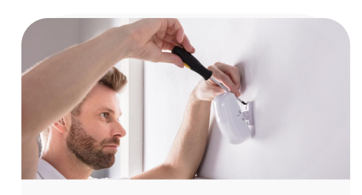
Fully Managed Alarm Service