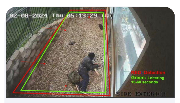
Monitor for break-ins and unauthorized presence and respond instantly with optional human intervention

Al-enabled camera detects and tracks dwell time in restricted areas