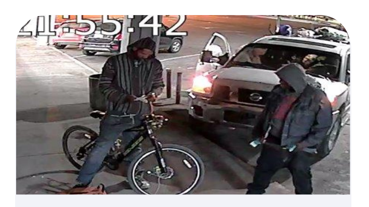
Detect loitering and vagrancy and respond with voice-down commands and strobe lights